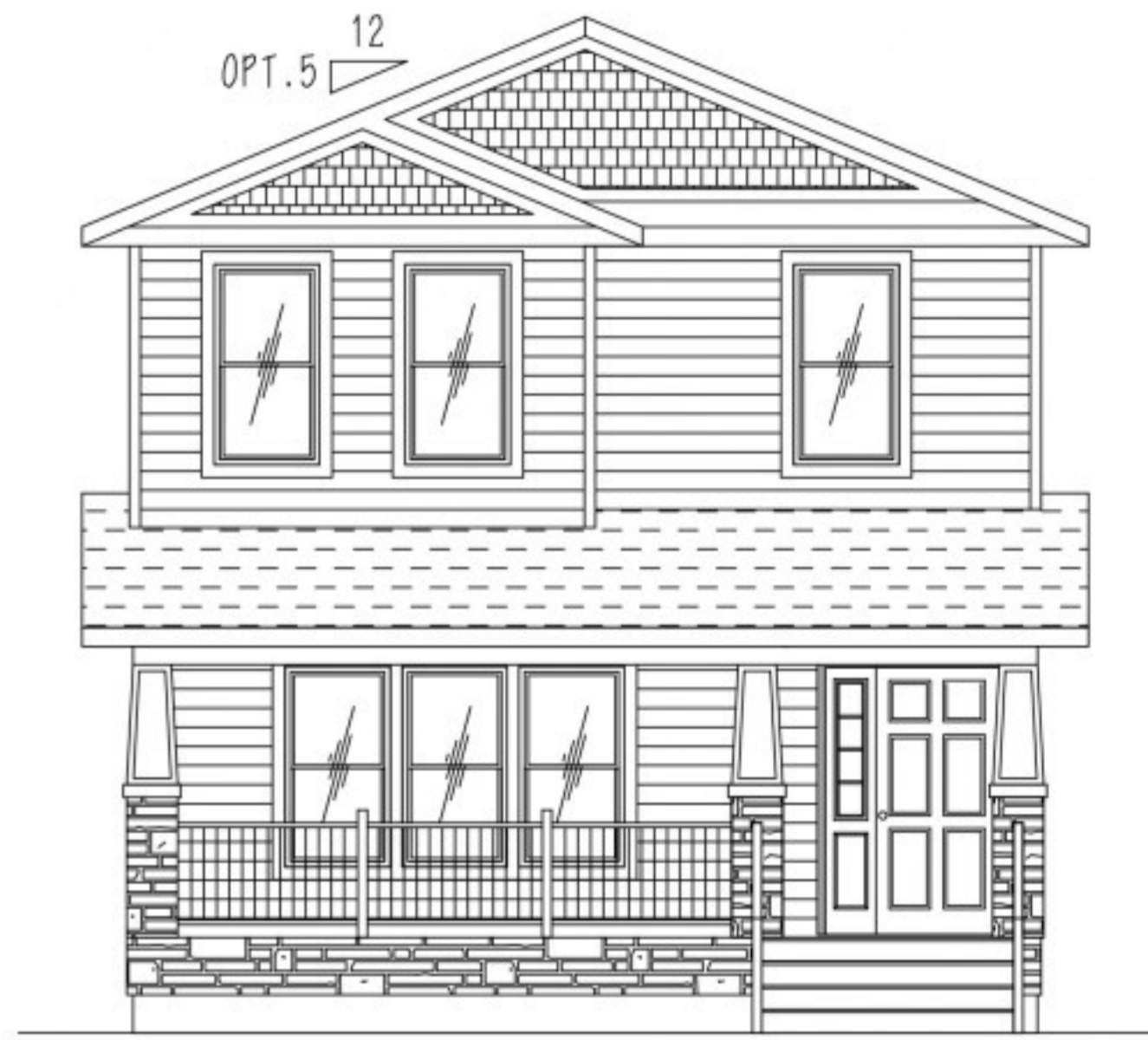
the "TAYLOR" [APPROX. 1718 SQ. FT.]