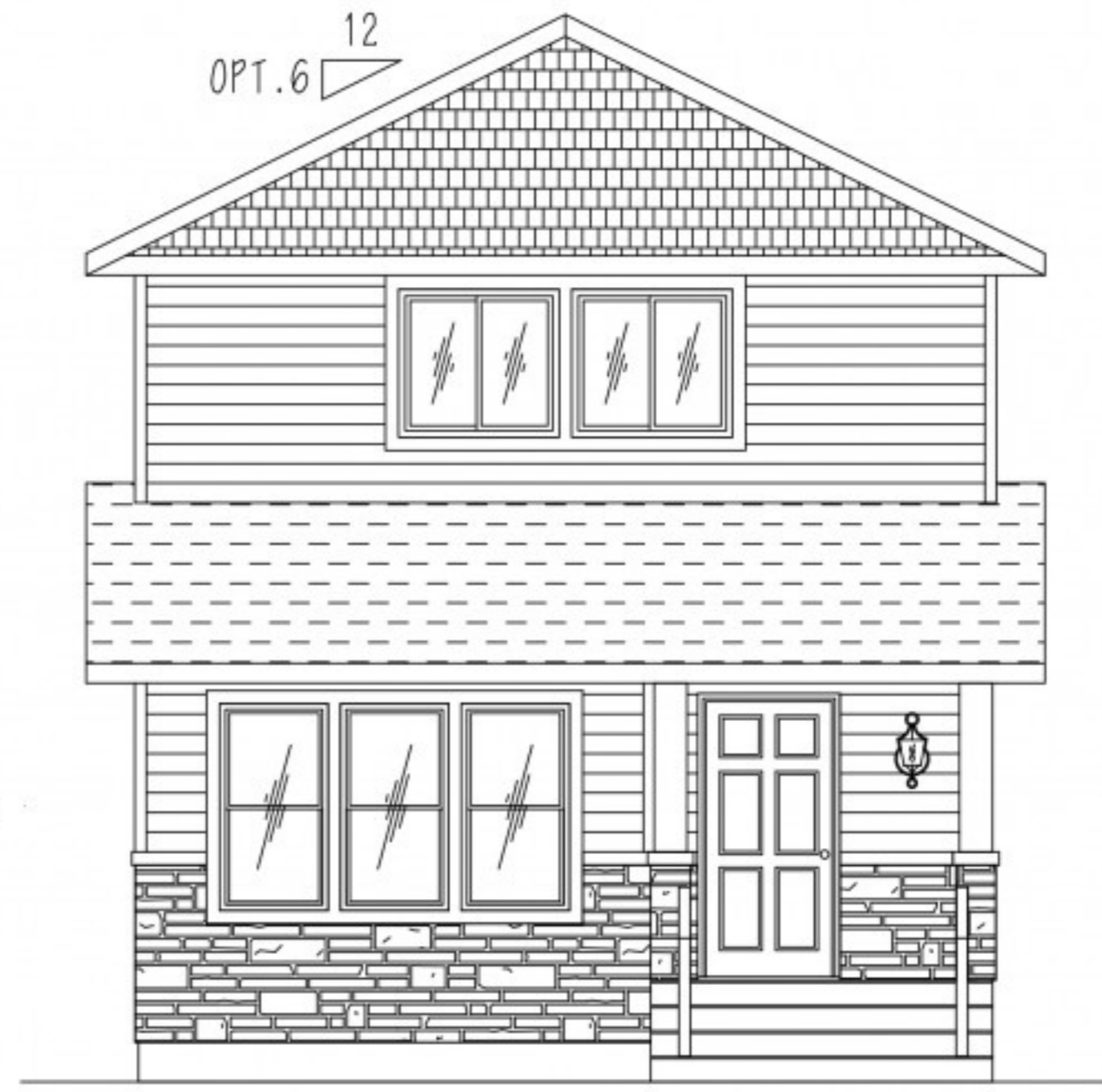
the "EDGEWOOD" [APPROX. 1507 SQ. FT.]