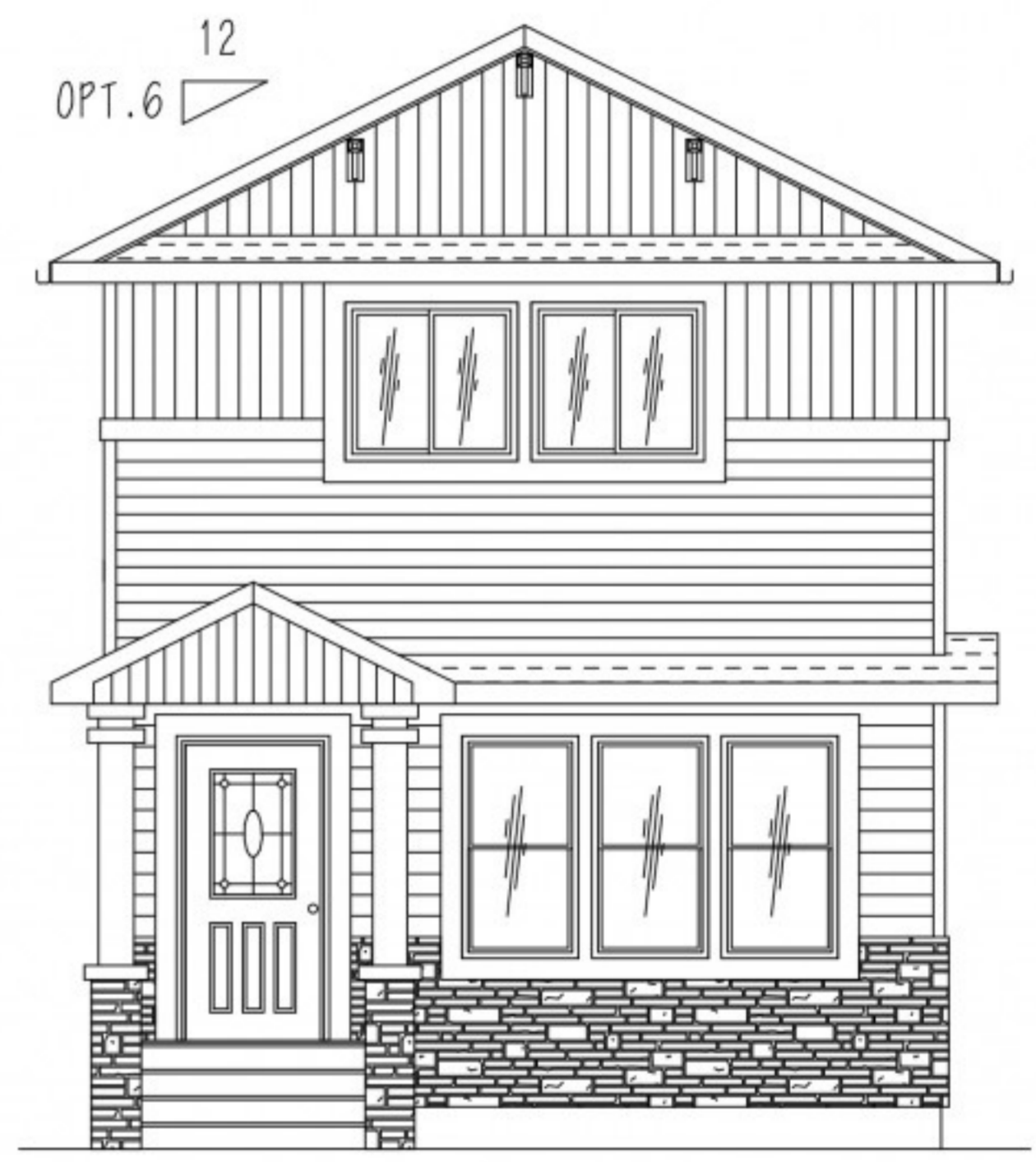
the "MORTON" [APPROX. 1336 SQ. FT.]