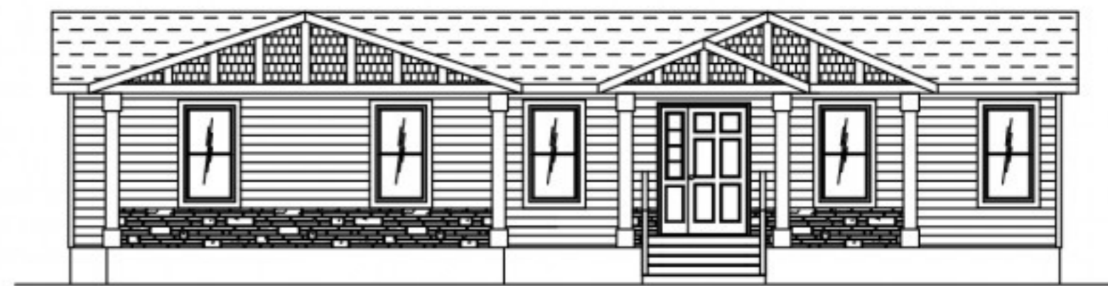
SAMPLE FRONT ELEVATION