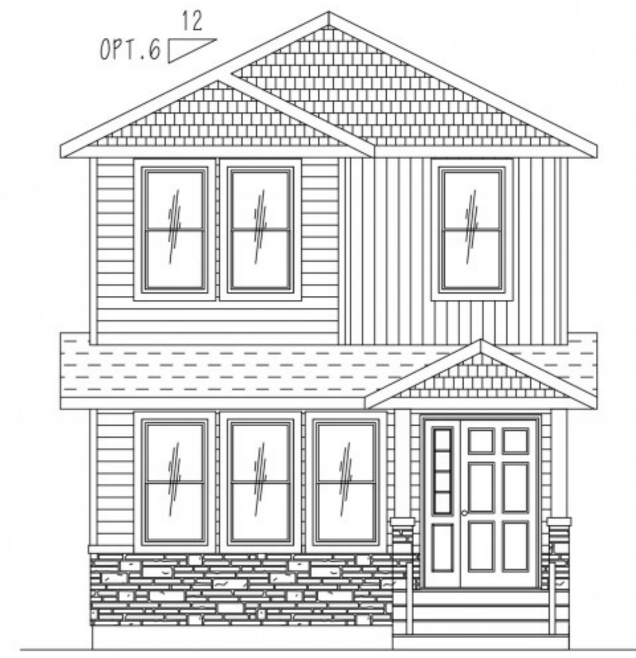
the "EDSON" [APPROX. 1415 SQ. FT.]