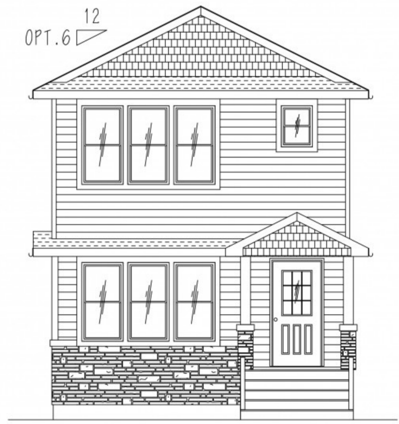
the "ATWOOD" [APPROX. 1455 SQ. FT.]